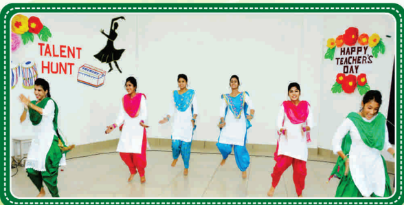
A zealous performance by the participants of 'Talent Hunt'.