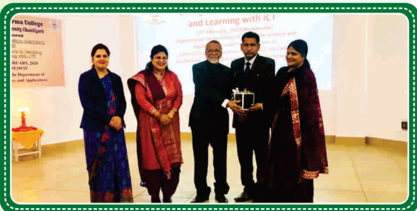
The Management, Principal & Convener felicitating the resource person during National Seminar by Comp. Dept.