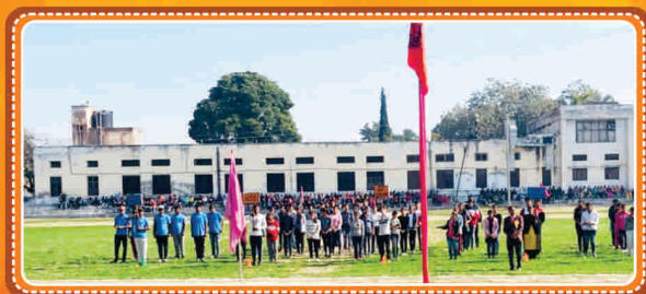
Glimpses of Athletic Meet