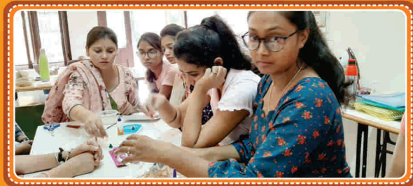
Workshop on Art & Craft items under the theme 'Earn While You Learn'