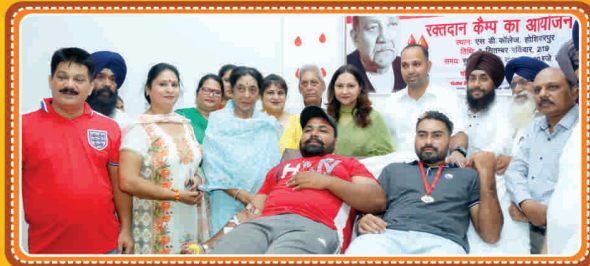
The clique from the city encouraging the good Samaritans during the Blood Donation Camp