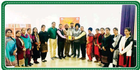
The Principal & faculty honouring the resource person on 'International Mother's tongue Day'.