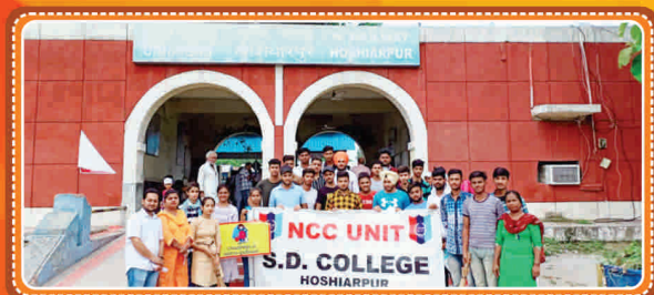
NCC Cadets during Cleanliness Drive (left)