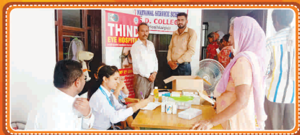
Eye-checkup camp by NSS Unit in Fadma, a village adopted by college (left)