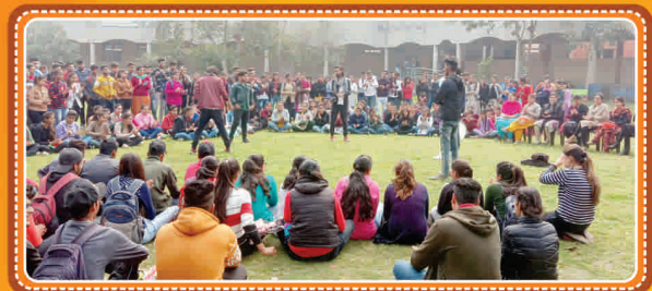
NSS unit enacting Nukkad Natak on the theme 'Save Environment' (right)