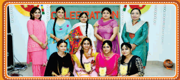
Celebration of Teej Festival in college