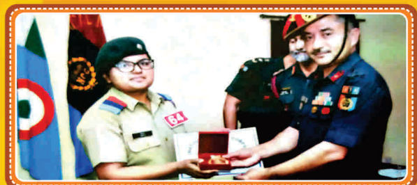
Our NCC ANO receiving gold medal & certificate of excellence in special skills competition during PRCN Course (right)