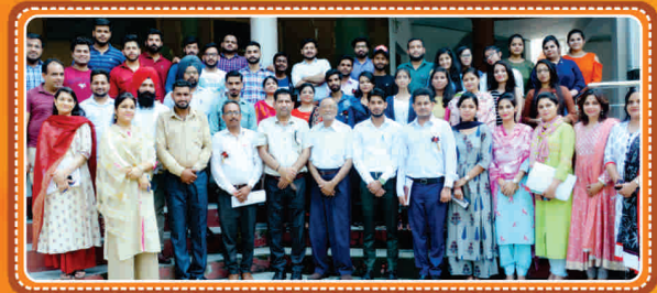
Our Alumni with Management and staff during 'Alumni Meet'