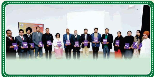
The Management, Principal, resource persons & staff members launching book during National Seminar organised by Dept. of Languages.