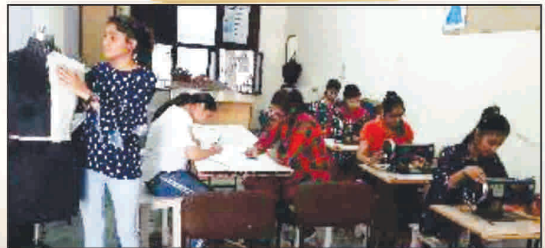
FASHION DESIGNING LAB