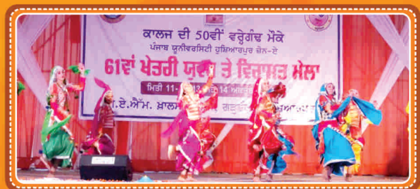
Still from an energetic performance by the participants of Luddi in Zonal Youth Festival