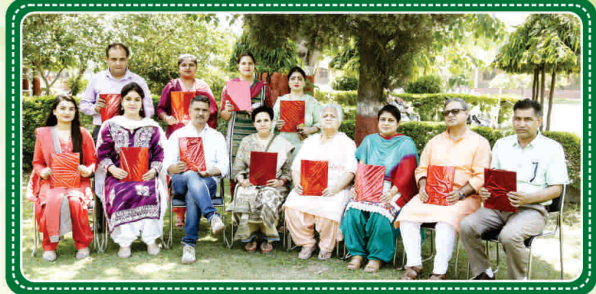
The management and the editors during the launch of the college magazine 'Shree Panchanan'.