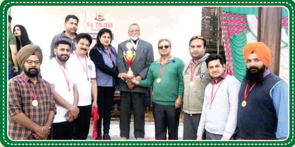
Victorious team receiving trophy for cricket match organised for the Management, teaching & non-teaching.