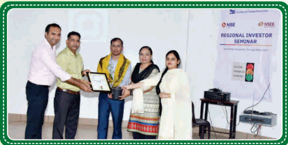
The Principal from College & Collegiate side & staff members presenting memento to resource person on National Seminar by Commerce Dept.